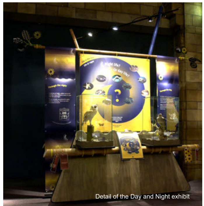
Detail of the Day and Night exhibit