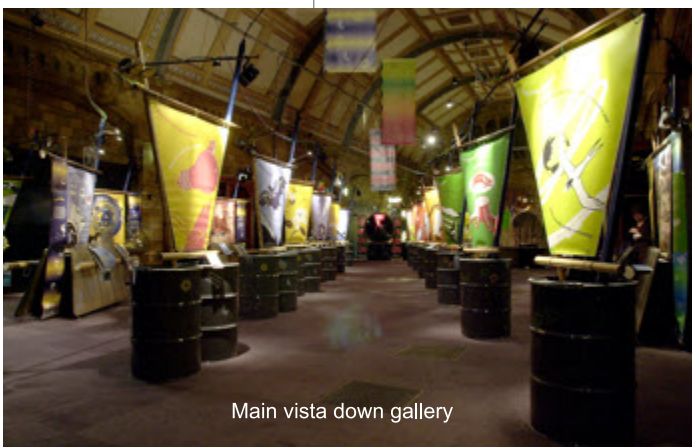
Main vista down gallery