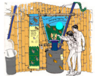
Visuals for the proposed exhibits